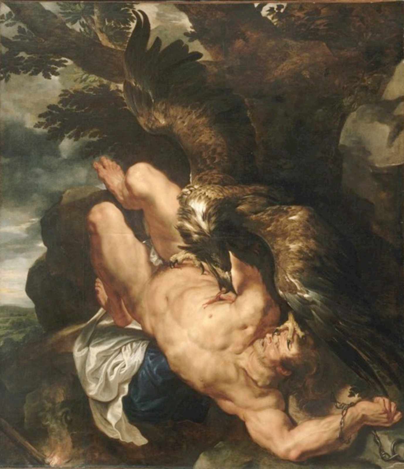
Peter Paul Rubens Prometheus Bound 1618