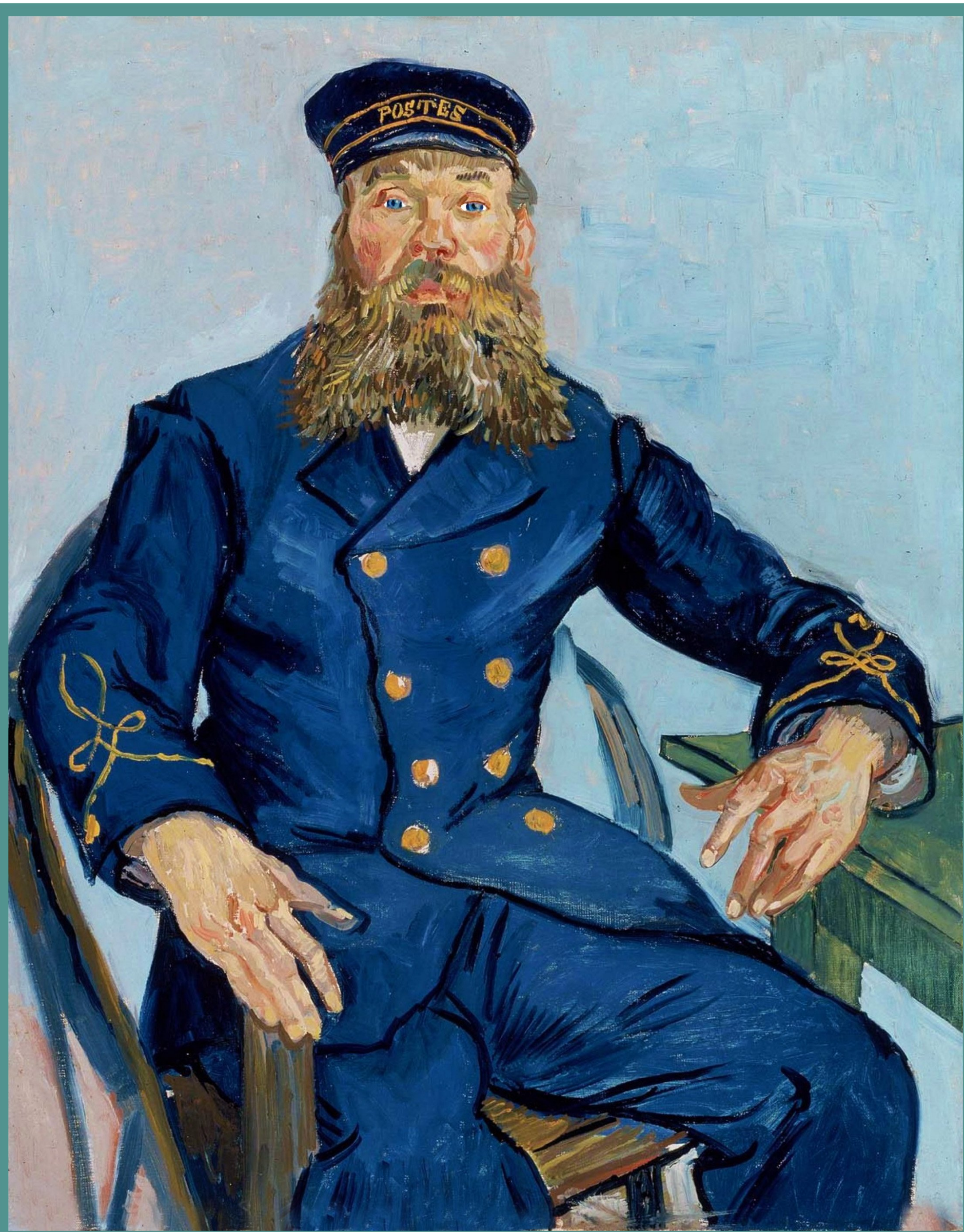
Vincent Van Gogh Portrait of the Postman Joseph Roulin